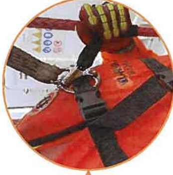
Lanyard attached to lifejacket with quick release hook