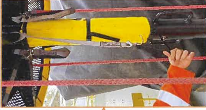
To access, lanyard is untied and released from centre